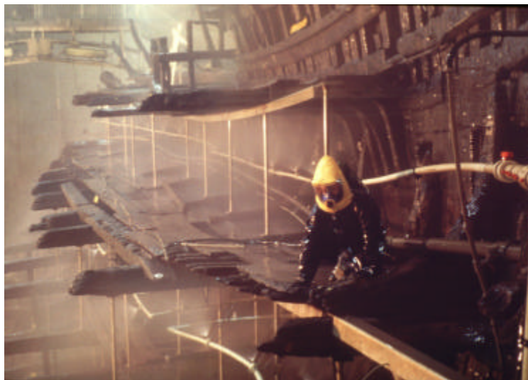
Spraying the Mary Rose to preserve the timbers.

The problem of the sulphur becomes real and serious when it is present next to iron. The Mary Rose , like many other wrecked ships, contains iron in the wood released from the completely corroded original iron bolts, nails and other objects in the ship. When these ships are taken out of the water and they come in contact with oxygen, iron catalyses oxidation of sulphur and produces sulphuric acid. This acid could damage the wood of the ship if no remedy is applied. Studies also show that uncontrolled atmospheric surroundings can accelerate this process. It is therefore important to display treated archaeological wood in a stable climate, without variations of humidity and temperature (recommended: about 55% relative humidity and a temperature of 18° C).