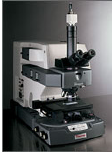
Figure 1: the infrared microscope at ID21

The motorized table can be lowered up to around 2 cm, for the analysis of large samples.